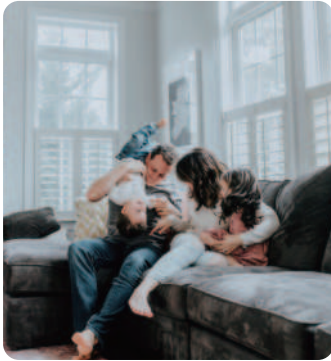
Household conventional electricity